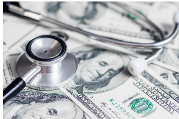
Practice Loan Payments