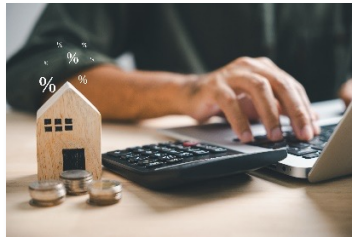
Rent & Mortgage Payments