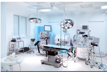
Leased Medical Equipment