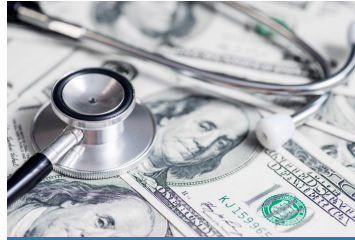
Practice Loan Payments