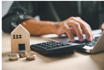
Rent & Mortgage Payments