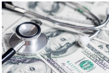
Practice Loan Payments