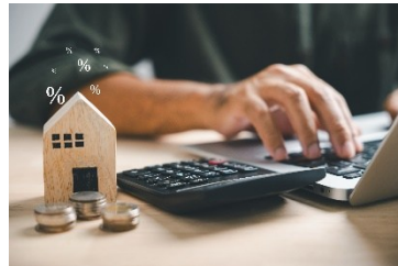
Rent & Mortgage Payments